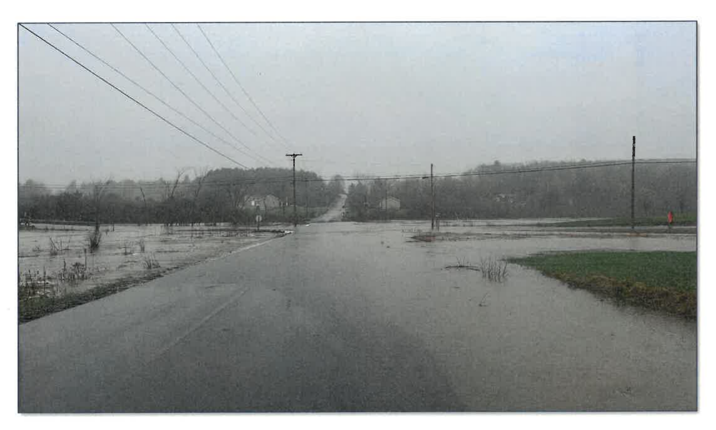
Intersection of East Rd and Avenue Rd, Wales ME, Road flooding.